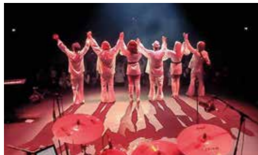
ABBA - Name of the Game Friday 14 th June

All our Tribute & Theme nights include a 3 course meal, entertainment and disco until midnight. £40.00 per person