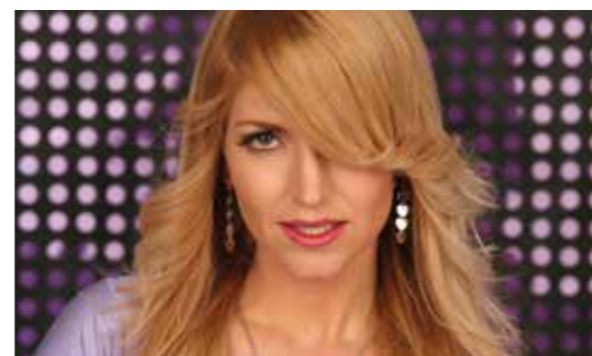
Madonna & Cher - Madonna Vogue Saturday 28 th September

For the past 16 years Vogue Madonna has been paying tribute to the incredible Queen of Pop along with a talented team of musicians and dancers.