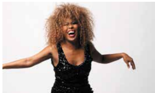
Tina Turner - Typically Tina Friday 9 th August

An evening of fun with a tribute to Sweden's finest. This 4 piece band will have you up to the likes of "Waterloo" and "Dancing Queen". One not to be missed!